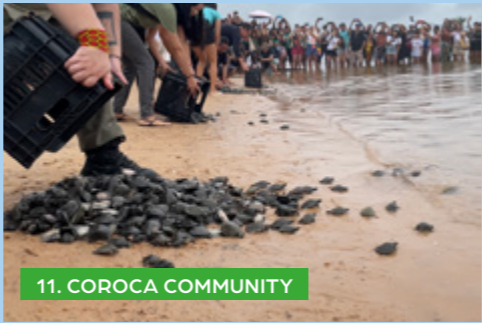
11. COROCA COMMUNITY