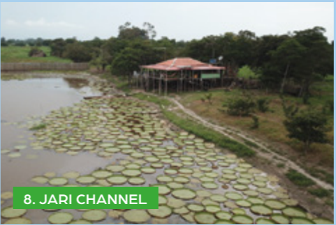
8. JARI CHANNEL