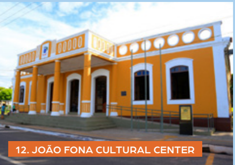
12. JOÃO FONA CULTURAL CENTER