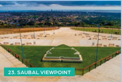
23. SAUBAL VIEWPOINT