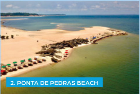
2. PONTA DE PEDRAS BEACH