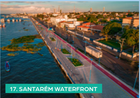
17. SANTARÉM WATERFRONT