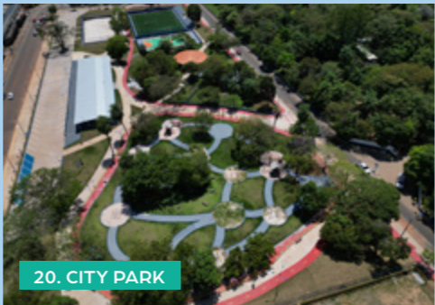
20. CITY PARK