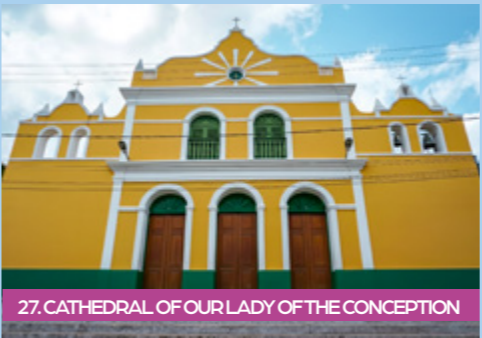
27. CATHEDRAL OF OUR LADY OF THE CONCEPTION