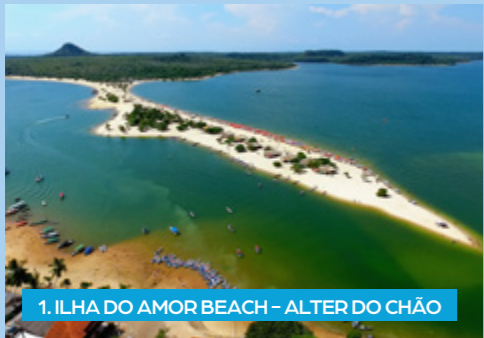
1. ILHA DO AMOR BEACH - ALTER DO CHÃO